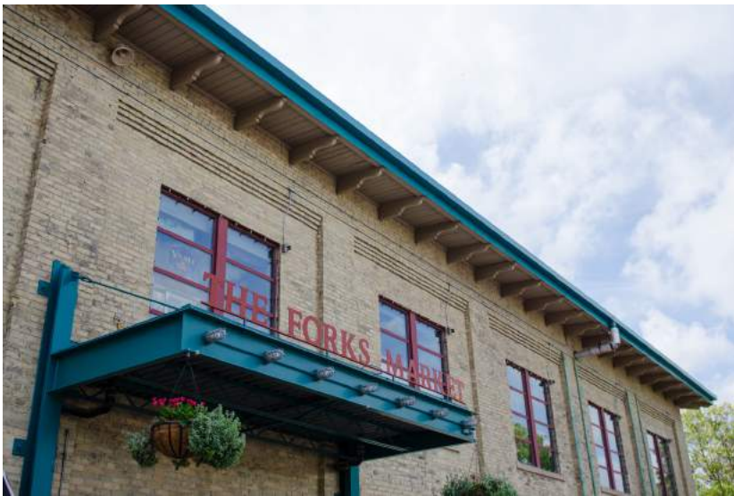
The Forks Market, part of The Forks National Historic Site in downtown Winnipeg.

Although there are no other official group tours, delegates and their families may want to take in some of the other fantastic attractions nearby.