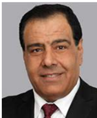
Dr. Izzeldin Abuelaish

more influential role in improving the quality of life throughout the Middle East through their education.