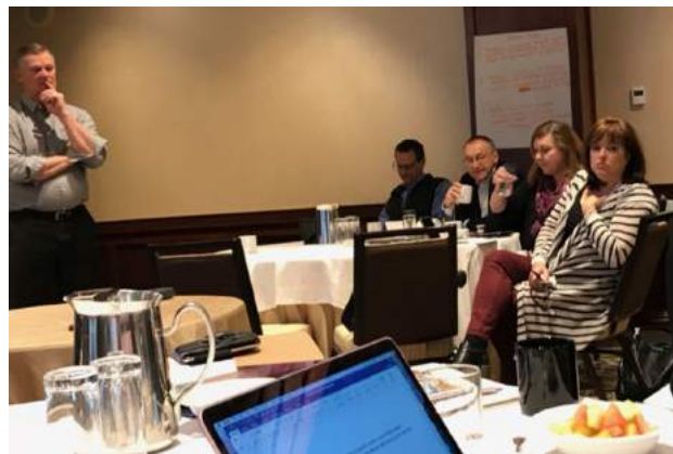
CASSA members gathered in Toronto recently for the annual winter planning session. Representatives from almost every province and territory were on hand for this productive gathering.